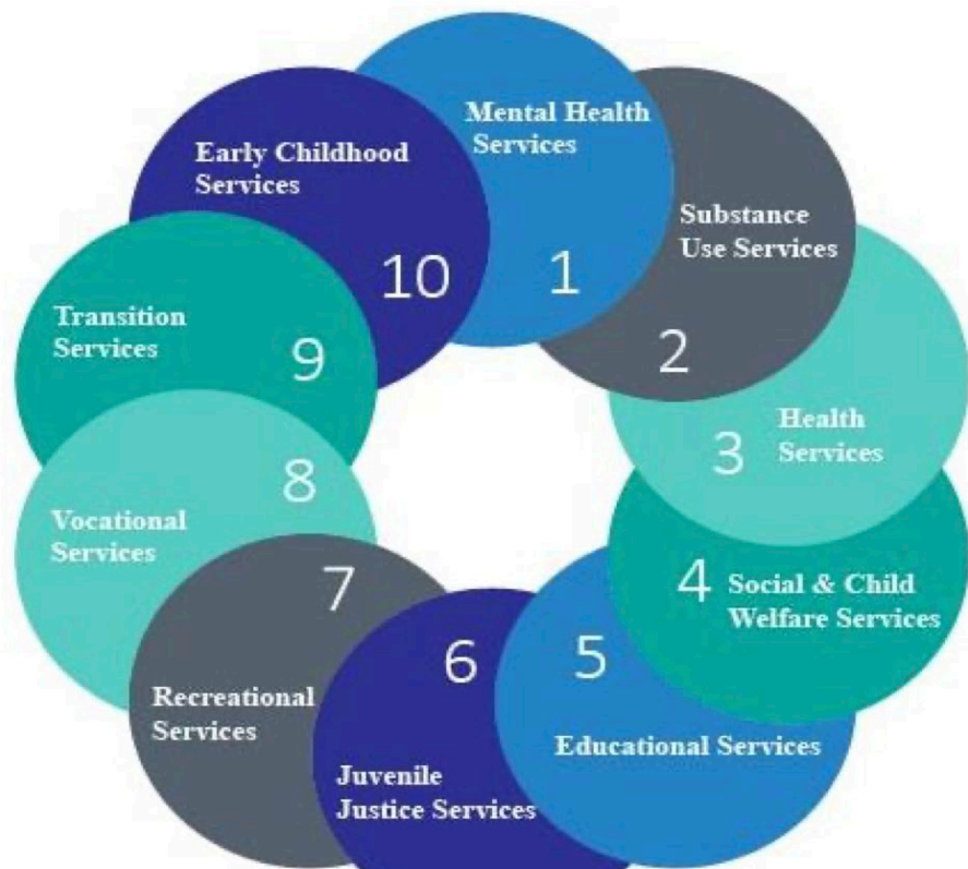
Figure 1. Dimensions of the System of Care Framework (Adapted from Stroul et al., 2010)