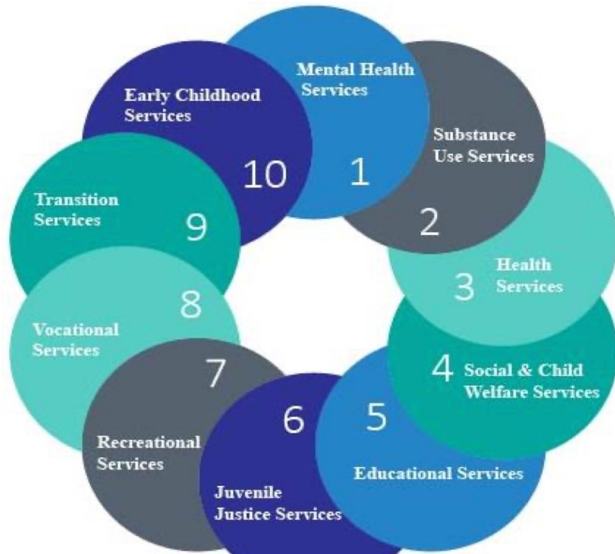
Figure 1. Dimensions of the System of Care Framework (Adapted from Stroul et al., 2010)