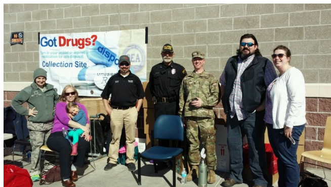
The DEA Drug Take-Back Day is a twice annual event supported by community coalition to increase safe disposal of medications and to decrease opioid misuse.

The SOA Department of Commerce facilitates the Prescription Drug Monitoring Program (PDMP) , a system for monitoring Schedule II-IV controlled substances dispensed throughout the state. Healthcare providers are required to report opioid prescriptions into the NarxCare PDMP database. Providers can also search the database to obtain a patient's prescription history, which can be used to create a real-time, comprehensive snapshot of a patient's risk of misusing or abusing opioids. The PDMP supports prescribers in ongoing efforts to encourage judicious and safe prescribing practices while providing a tool to determine if referral to a treatment program is appropriate, thereby contributing directly to improved health outcomes. Overall, the PDMP has seen a 6 fold increase in the number of registered users since 2013, and a 15% decrease in the total number of opioid prescriptions entered into the system since 2016 (AK PDMP-2019 Legislative Report).