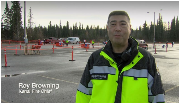
In October 2018 Kenai Peninsula hosted a drive-through event to distribute Project HOPE overdose rescue kits and training.