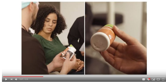
Public service announcements on the effectiveness of non-opioid pain management aired statewide in early 2019.

Equally important to lessening the risks of substance misuse and addiction is reducing the public’s access to controlled substances and decreasing the importation of illicit drugs into Alaska’s communities. These efforts can require complex, long-term coordination with federal partners. Alaska’s Department of Public Safety was instrumental in working with law enforcement agencies statewide to conduct several activities aimed at combating opioid trafficking leading to distribution. With the addition of Alaska being designated a High Intensity Drug Trafficking Area (HIDTA), several advances were made in the existing drug enforcement task forces statewide.