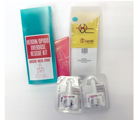
Project HOPE, a DHSS initiative, partners with community organizations to distribute overdose rescue kits and trainings. Since its beginning in 2017, 108 community partners have distributed 24,692 kits.

Sharps disposal units enable anyone to safely dispose of used needles. Increasing healthcare provider knowledge of harm reduction strategies enhances discussions related to substance misuse between provider and patient.