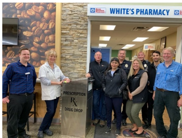
Sitka's HOPE Coalition convened community partners in a shared effort to improve medication disposal options in their community. This effort was supported through their role as a sub-beneficiary of an opioid federal grant received by DHSS.