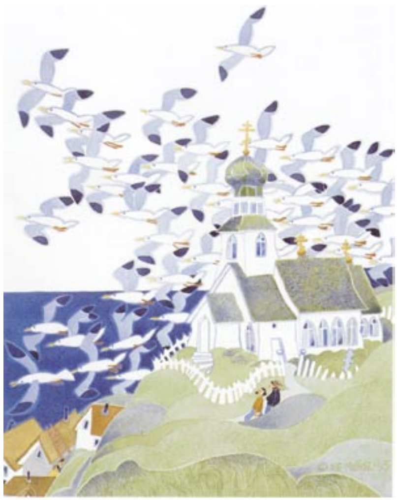
"Kittiwakes, St. George"