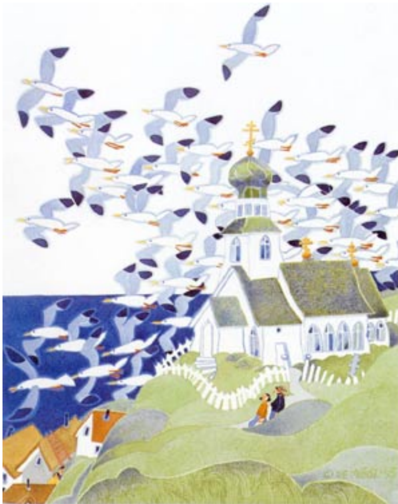
"Kittiwakes, St. George"