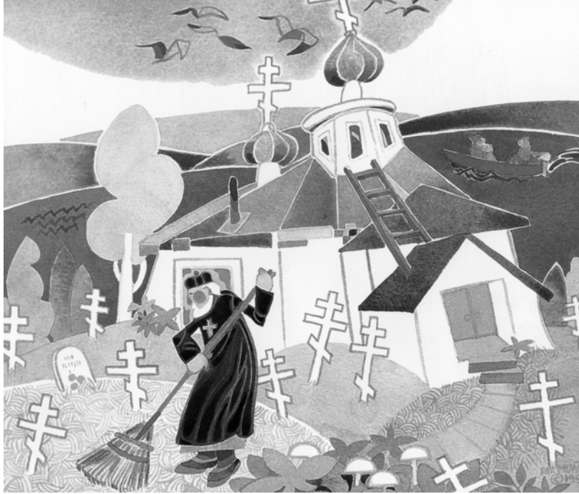
"Priest, Yukon River"