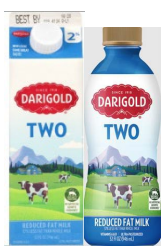
2%: 026400276005 Whole: 026400290001

Approved Quart-size Darigold Product UPCs: