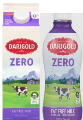
Fat Free: 026400297000 1%: 026400298908