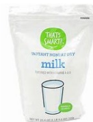
That's Smart Instant FF Dry Milk 25.6oz and 9.6 oz