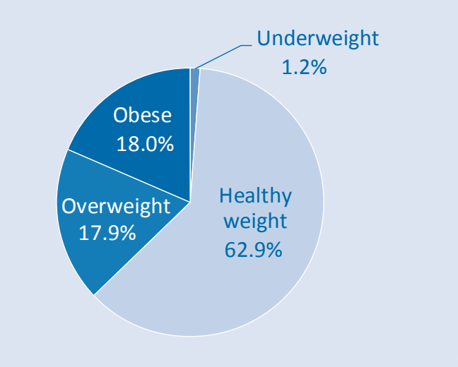
Figure 1: Student Weight Status among KPBSD Students,