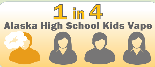
Data Source: Alaska Youth Risk Behavior Survey (YRBS) 2019

The number of Alaska high school students who smoke combustible cigarettes has decreased over time and many lives have been saved, but there is still work to do. 781 Alaska students were suspended for tobacco use and lost more than 1800 days of school in 2018-2019