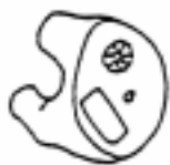
In-The-Ear Aid (ITE)