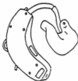
Behind-The-Ear Aid (BTE)