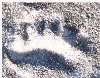
SDS Information Sharing Session