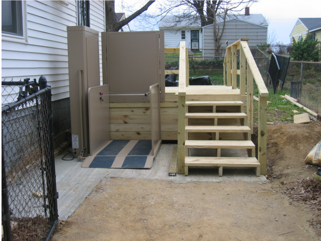
Exterior platform lift installed to the left of stairs

A platform lift provides a vertically rising and descending landing that transports a person from one level to another. Platform lifts work for people either with or without a wheelchair. They are often used to get up onto a deck or porch. There are many types and styles. Some are open, and some are fully enclosed by metal siding or windows or a combination of the two.