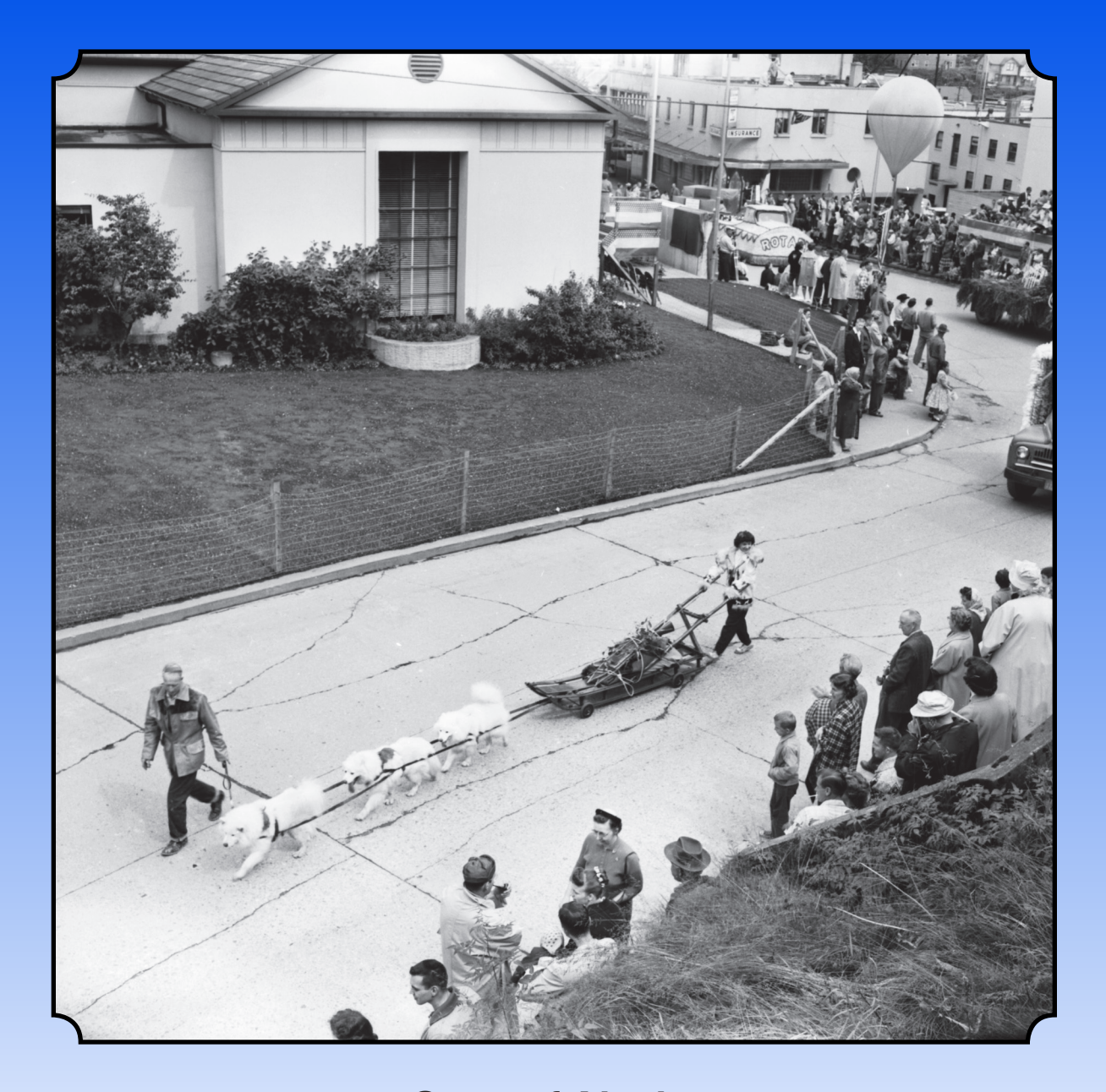
State of Alaska Department of Health and Social Services Fiscal Year 2019 Operating Grants